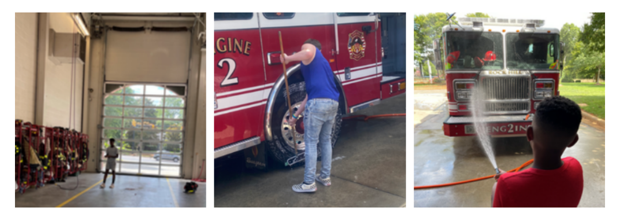
Several residents completed a community service project giving back to the men and women who protect and serve.